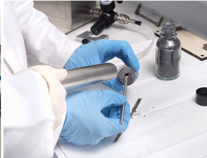
The Nanosafety Platform workstation measurement laboratory